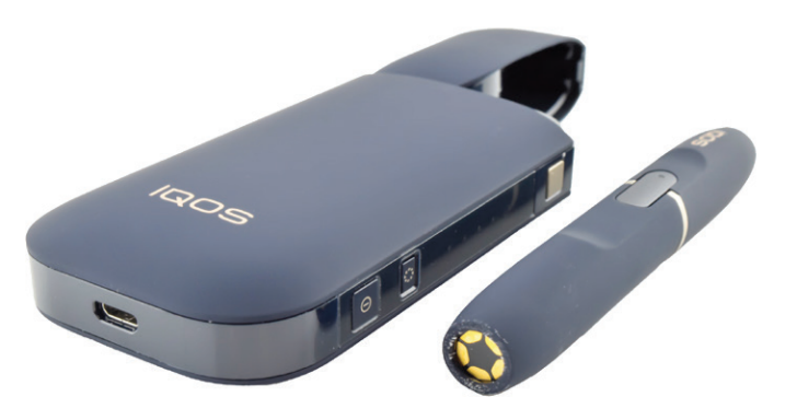
Figure 3. Heated Tobacco Product "IQOS" (I Quit Ordinary Smoking)

Heated Tobacco Products (Figure 3): Heated tobacco products such as Altria/Phillip Morris International's IQOS, approved for sale in April 2019 by the FDA,<sup>12</sup> are also electronic devices; however, they heat tobacco to produce an aerosol containing nicotine.<sup>13,14</sup> The FDA is reviewing an application from the tobacco industry to allow the IQOS to be marketed as a less harmful alternative to cigarettes. Altria/Phillip Morris International is beginning to sell IQOS in stand-alone stores in Virginia.